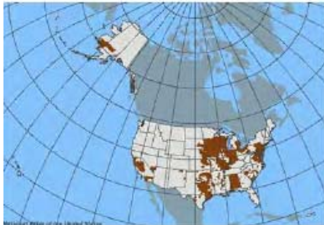
Locations of Extreme Heat Events, 1995-2000