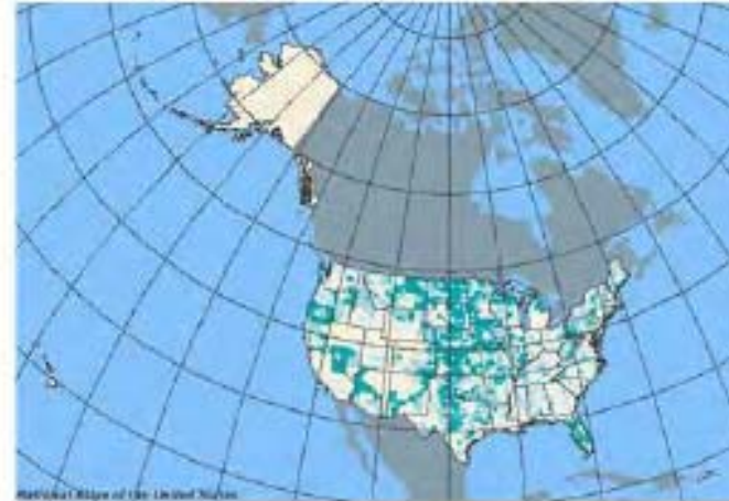
Percentage of US Population 65 or older, 2000