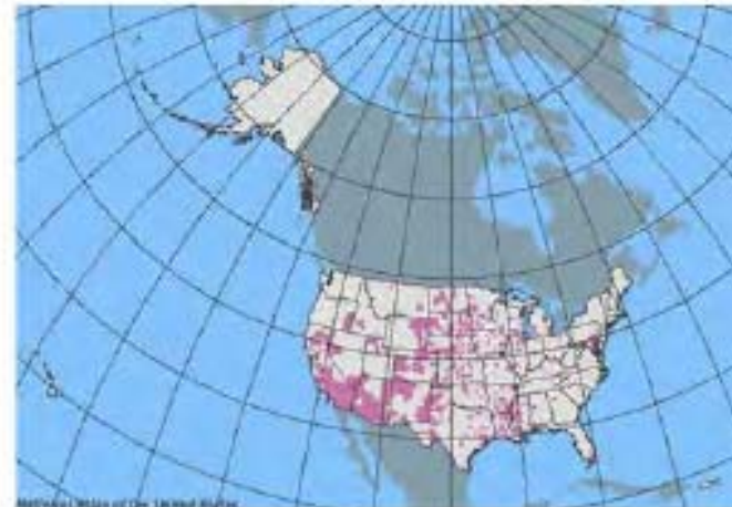
West Nile Virus Cases, 2004