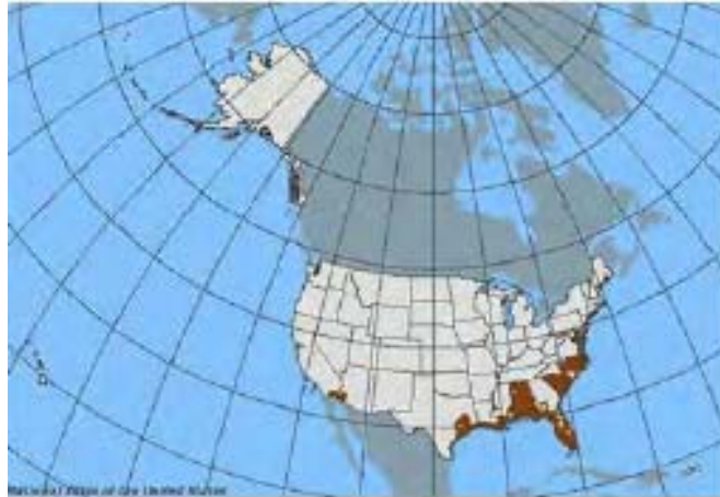
Location of Hurricane Landfalls, 1995-2000